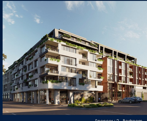
Spencer: 2 - Bedroom