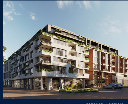
Roden: 2 - Bedroom