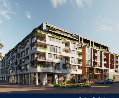
Roden: 2 - Bedroom